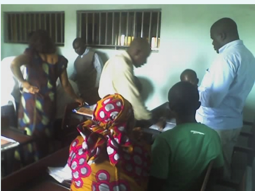
Destiny Class during their unlocking potential skill Practices

The Centre for Entrepreneurship and Development Research, University of Nigeria, Nsukka started recruitment and training of its core staff in March, 2008. However, the actual training of students (trainees) started on May 5, 2008. Onitsha was chosen as the venue for the training because of its strategic location as commercial nerve centre of the South East. Onitsha also has the highest population of job seekers in the South East, as well as the highest concentration of small-scale businesses. There are two venues for the EDC in Onitsha. One is located at Ononenvi Plaza. No 2 Awka Road which serves as Head Office and the