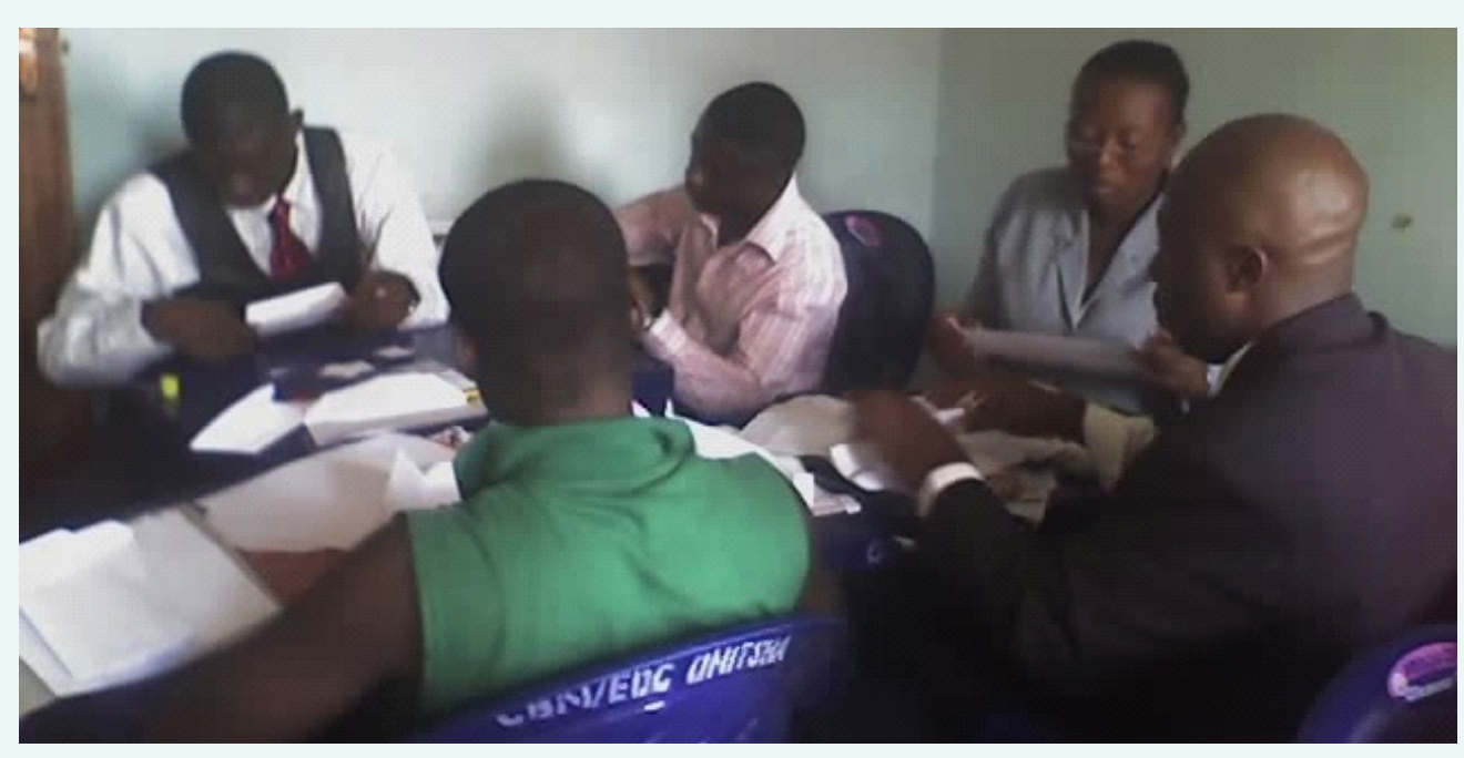
Knowledge Class in their Envelop Games