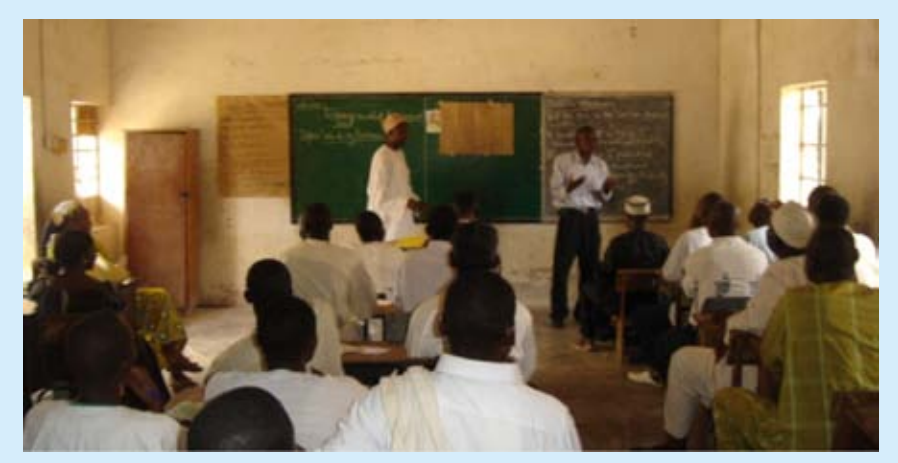
Cross section of a typical EDC class session at Kano EDC Centre

beneficiaries to develop their business plans.