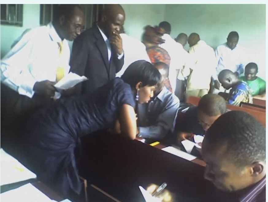
Royal Class during their Practical and Discussion

The graduates from the programme are perfecting their business plans to