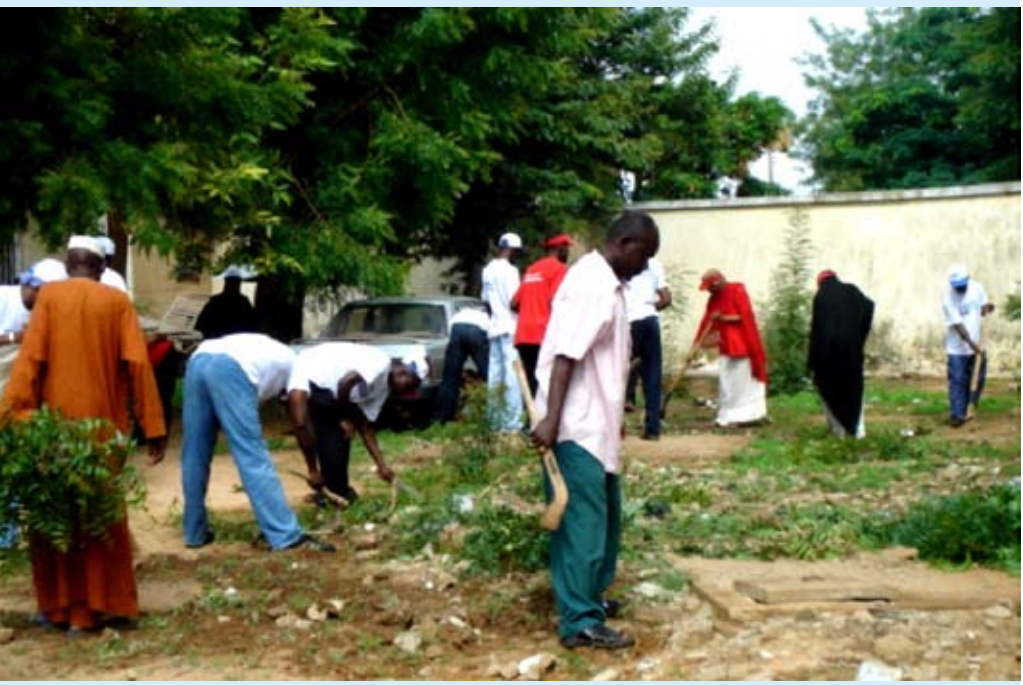
EDC beneficiaries, OICI Staff and Oceanic bank staff during a typical Community Development Service day.

There are three core units of the project namely; leadership, entrepreneurship development and business development units. Other units are community service (corporate responsibility), mentoring, monitoring and evaluation (M&E). The leadership unit is designed to provide solution for clients with problems of lack of funds. The Strategy adopted by the unit is to reassure them that their decision to come to OICI whose motto is 'Transforming hopelessness into hope, through human resource development' was appreciated. Following this, the clients are encouraged to open up on their areas of need to the leadership specialists at the Centre and also express what their expectations are. The clients are then counseled on their hopes and aspirations and guided in making informed decisions to either participate in the training programe or not. Information is further given to them on how to register, the nature of the training, as well as the Community Service and Mentoring components. The "carry five" (C5) components is also discussed. Carry five is intended to encourage the clients to assist at least five that all requirements have been satisfied.